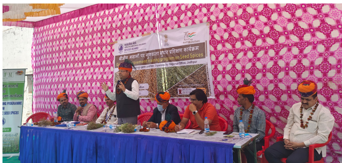
Delegate speaking at Qulaity Improvement Training Programme on Seed Spices organized by Spices Board, Jodhpur