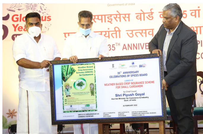
Launch of Weather Based Crop Insurance Scheme for Small Cardamom