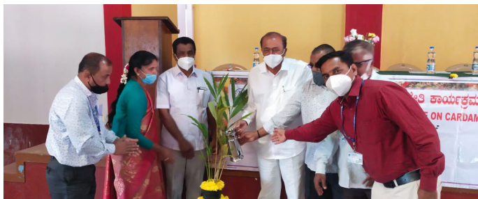
Quality Improvement Training Programme on Small Cardamom organised Field Office, Somwarpet