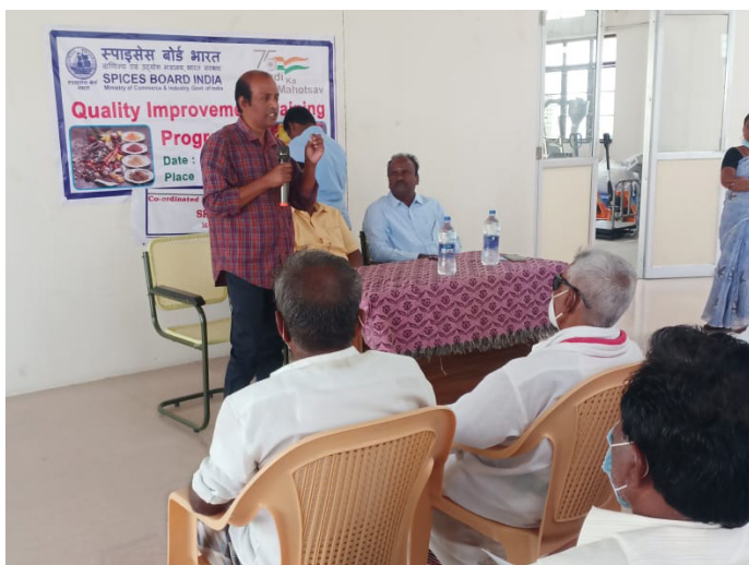
Farmers Training Programme on Chilli at Mudhugulathur, Ramnad

Spices Board, Field Unit, Batlagundu organized a Farmers Training Programme on Chilli at Mudugulathur, Ramnad District on 17 February 2022. Good Agricultural Practices for quality chilli production and Integrated Pest Management were the focus areas of the training. About 50 farmers representing various parts of the Ramnad District attended the programme. The advantages of obtaining GI registration for Ramnad Mundu Chilli were explained. Ramnad Mundu Chilli Producer Company Limited in association with the Tamil Nadu Agricultural University has filed an application with the GI registry and the registration is under process. The Mundu chilli has the highest capsaicin content of 0.35% compared to other local varieties of Sannam type. The programme was coordinated by the Ramnad Mundu Chilli Producer Company Limited.