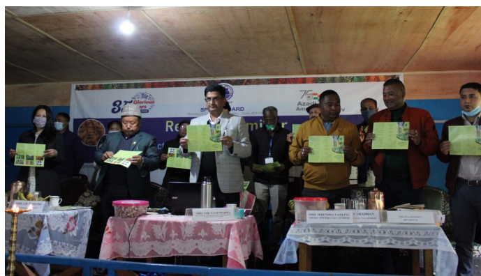
Release of pamphlet on blight control in Large Cardamom in Nepali during the Regional Seminar at West Sikkim