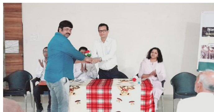
Quality Improvement Training Programme on Ginger organized by Spices Board Regional Office, Mumbai