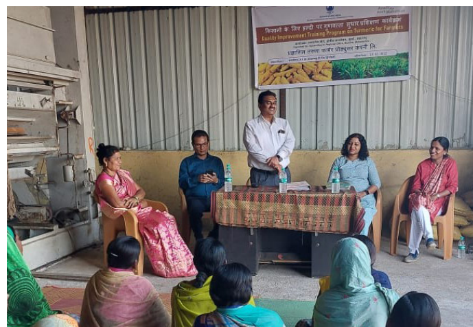
Quality Improvement Training Programme on Turmeric for Women Farmers organized at Hingoli

Spices Board Regional Office, Warangal conducted a Quality Improvement Training Programme for Chilli Growers of Cherla village, Bhadrachalam Kothagudem District, Telangana on 14 February 2022. Around 70 progressive chilli farmers, traders, people representing print and electronic media participated in the programme.