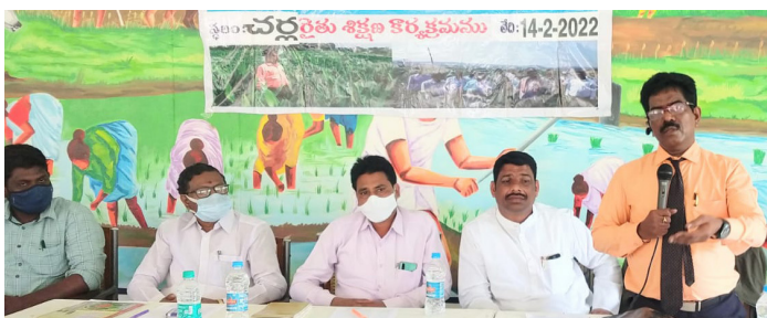
Quality Improvement Training programme for Chilli Growers organized by Spices Board, Warangal

Spices Board, Regional Office, Mumbai organized a Quality Improvement Training Programme on Ginger for farmers from Sillod, Aurangabad region on 22 February 2022. Around 50 farmers participated in the programme. The farmers were informed of the opportunities for ginger export and need for quality production. The farmers were also sensitized on adopting Good Agricultural Practices, Integrated Pest Management and Organic farming. Some of the progressive farmers and members of Farmer Producer Organisations shared their experiences and success stories. According to the Agriculture Department, in Aurangabad, more than 3500 hectares of ginger cultivation is reported from the talukas of Kannad, Phulambri and Sillod.