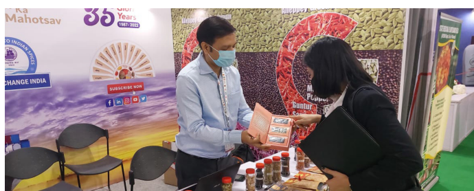
Spices Board's stall in India Hospitality, Food & Beverage Pro World Expo 2022.