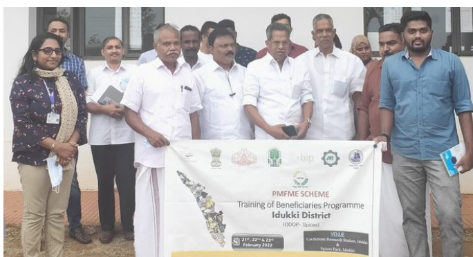
Training Programme organized under the Prime Minister's Formalisation of Micro Food Processing Enterprises Scheme, for Micro Entrepreneurs of Idukki