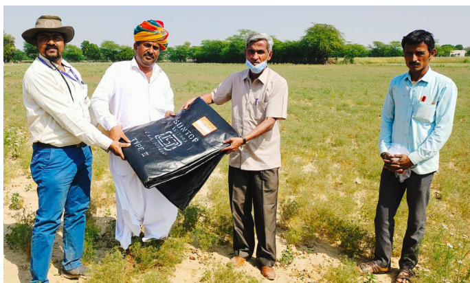
Distribution of HDPE tarpaulin sheets to cumin farmers in Gudamalani

Spices Board, Bodinayakanur organized a six-day Skill Training Programme for Rural Youth (STRY) on Nursery Management in Spices during 28 February 2022 to 05 March 2022. The programme was funded by the ICAR-MANAGE through ATMA & SAMETI. The candidates qualified in the skill test and post training evaluation are issued with certificates and Black Pepper rooted cuttings.