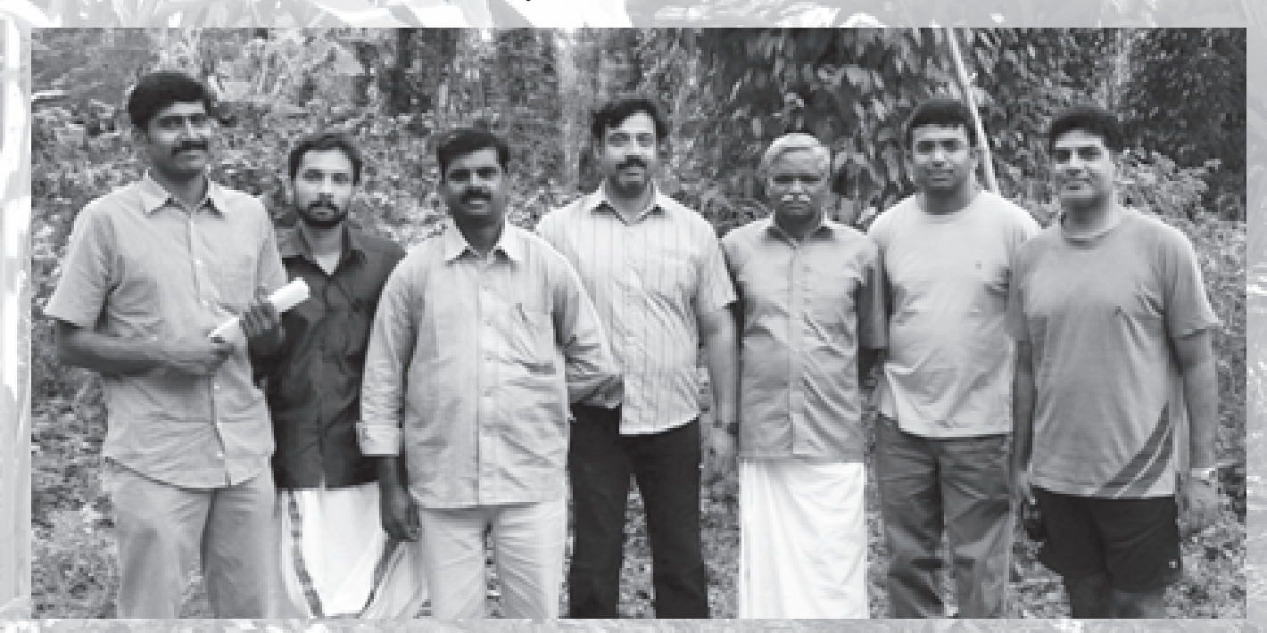
Sholayur cardamom farmers

young farmers it is something saddening. Knowing this, the extension wing of the Spices Board in Coimbatore started taking initiative to introduce the farmer groups to the supply chain in A meeting of the spices. cardamom growers of Attappady which attended was bv representatives of export houses actually set the ball rolling. The meeting held at Attappady revealed the potential of the area in terms of production of cardamom. M/s Synthite