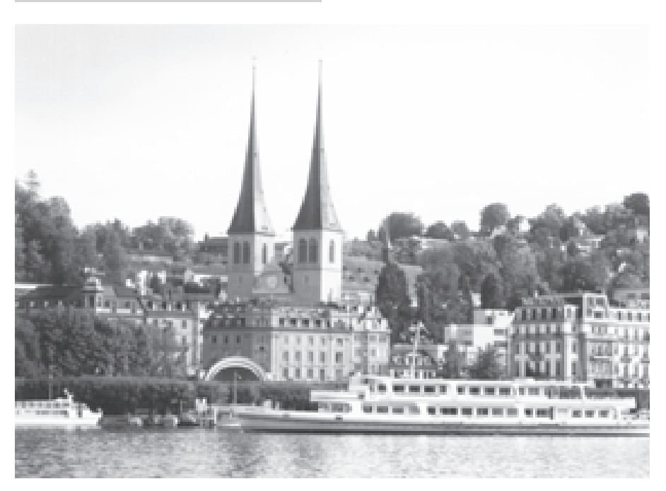
The shoreline of Lucerne

Status is built into the human psyche and it didn't require princes, politicians and prelates to