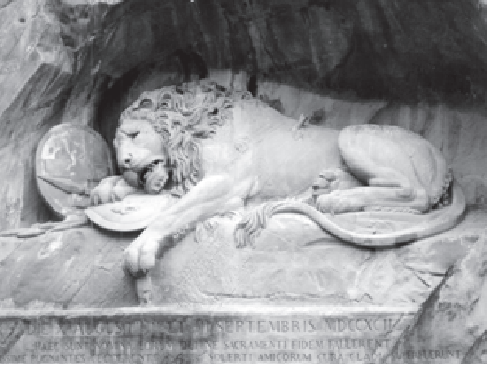
The famous 'Lion of Lucerne'

like an illuminated manuscript, with a fantasy of animals, vegetable and humans.