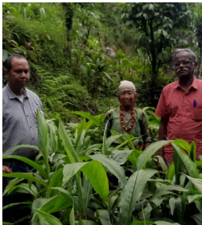
■ Field visit at Mangshila, North Sikkim.