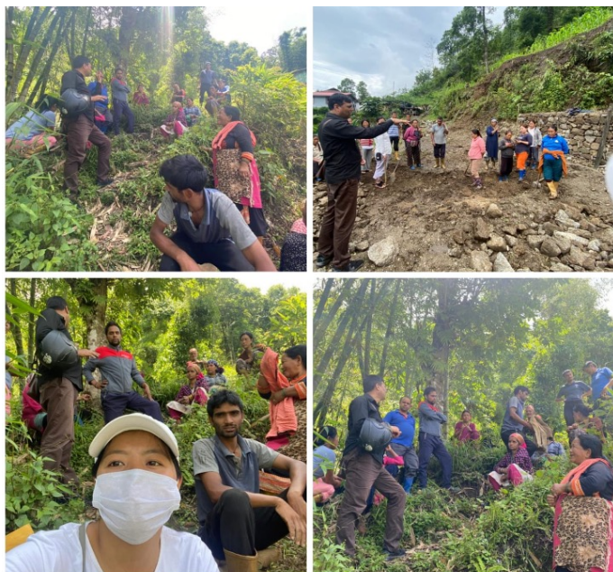
Glimpses of extension and awareness programme organised at Tenkilakha and Ganchung villages.

Divisional Office, Spices Board, Tadong organised extension and awareness programmes at Tenkilakha and Ganchung villages in East Sikkim on 25-26 May 2022. Schemes and activities of the Board were discussed in general. Around 39 farmers participated in the programme.