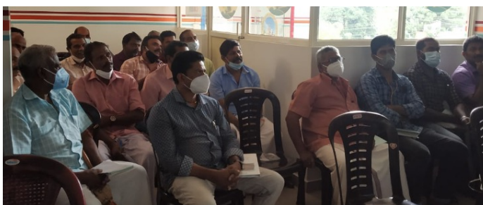
Members from the Jai Kissan Development Society attending the training programme.