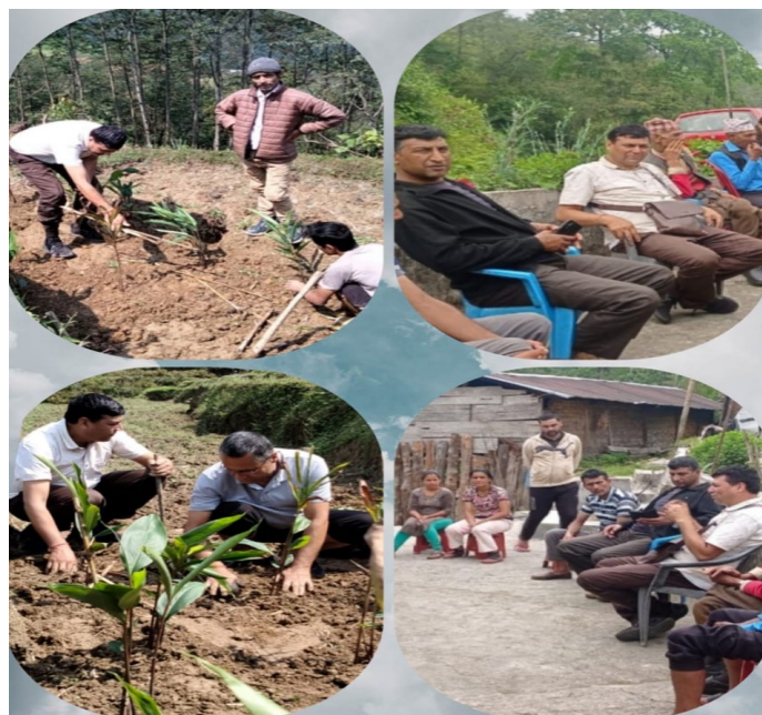
Awareness programme on various activities of Spices Board and field level demonstration of large cardamom replantation and sucker nursery at East district, Sikkim.

Divisional Office, Spices Board, Tadong conducted an awareness programme on various activities of Spices Board and field level demonstration of large cardamom replantation and sucker nursery on 28 April 2022 at Machalakha and Tumin Dhanbari locations of East district, Sikkim.