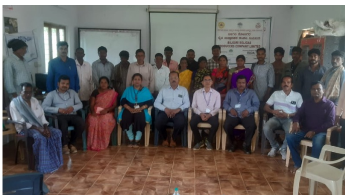
Training programme at B R Hills, Chamarajanagara area organised by Regional Research Station, ICRI, Sakleshpur.