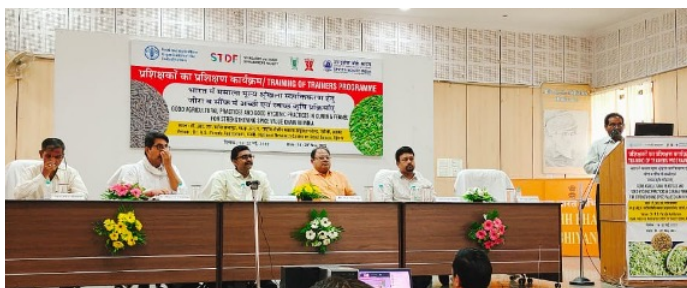
■ Dignitaries at the masters training programme.