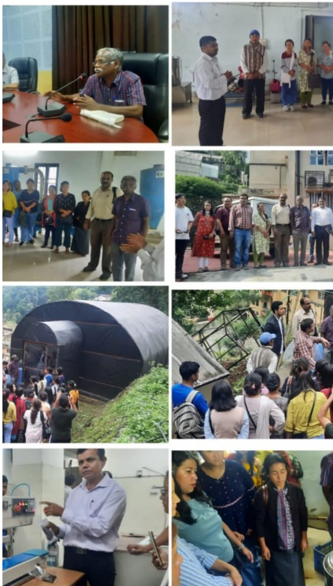
Exposure visit for women's Self Help Groups organised by Divisional Office, Spices Board, Mangan.

Divisional Office, Spices Board, Mangan, Sikkim organised an exposure visit for women's Self-Help Groups (SHGs) belonging to the tribal reserved area of Dzongu under Livelihood Enterprise Development Programme supported by NABARD, Gangtok and organised by Bhavishya Bharat Organisation on 25 May 2022. The women farmers were exposed to technical knowledge on various aspects of spice value addition, packaging, marketing etc., imparted by experts from the College of Agricultural Engineering and Post Harvest Technology (CAEPHT), Central Agriculture University Ranipool, Deputy Director, Spices Board, Gangtok and Scientist in-charge, Indian Cardamom Research Institute, Tadong. Positive feedback was received from the women farmers who expressed interest in undertaking value addition of their local produce like cardamom, ginger, turmeric etc., after the exposure visit.