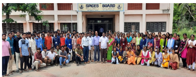
Students from Annamalai University at Regional Office, Spices Board, Bodinayakanur.

Students pursuing B.Sc. Honours in Horticulture at the Department of Agriculture, Annamalai University, Chidambaram visited the Regional Office, Spices Board, Bodinayakanur on 04 May 2022. The programme was coordinated by the officials of Spices Board. Nutritional and medicinal properties of spices and the status of spices cultivation in Tamil Nadu were discussed in detail. The problems and prospects of spices cultivation and the marketing opportunity for the spices produced in Tamil Nadu have been explained to the students. Integrated Pest Management (IPM) technologies for safe and quality spice production were also explained. General activities and the functioning of cloud-based e-auction system were also briefed to the students.