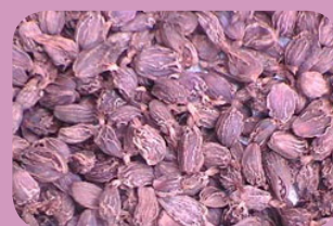
Dried large cardamom