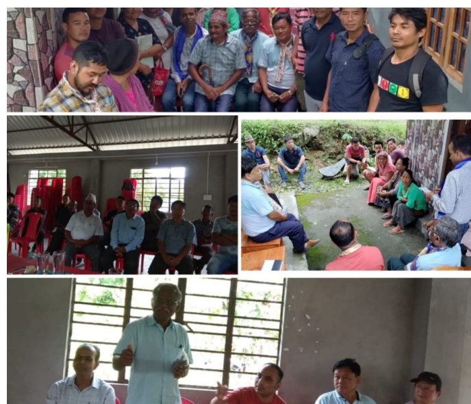
Awareness programmes on the activities of Spices Board at Darjeeling.

Divisional Office, Spices Board, Kalimpong, West Bengal conducted awareness programmes on the activities of Spices Board at Lower and Sebjay village of Sittong 1 Gram Panchayat of Darjeeling district on 11 May 2022 in association with Water Use Association, Sittong.