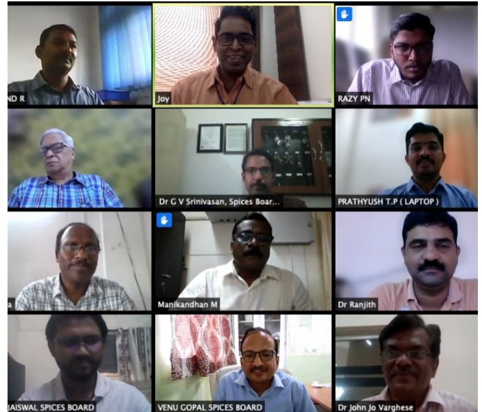
Screenshot of lead auditor training.

Spices Board, Kolkata, organised International Register of Certificated Auditors (IRCA) Certified Training for lead auditors as per ISO 22000:2018 Food Safety Management System during 19-23 May 2022 under the Collaborative Training Cell. The programme was conducted in online mode and around 10 officials of the Spices Board attended the programme.