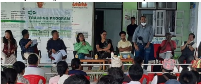
■ Awareness cum training programme at Mangshila, North Sikkim.