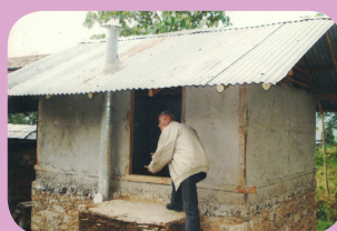
ICAR modified bhatti system