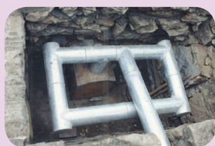
Flue pipe system for curing large cardamom capsules