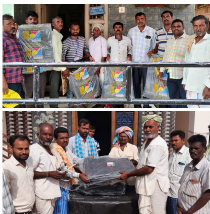
Distribution of tarpaulin sheets to chilli farmers under Regional Office, Spices Board, Haveri, Karnataka.