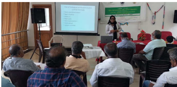
Training programme on organic farming and certification organised at Spices Park, Puttady by Field Office, Spices Board, Puttady.

A one-day training programme on organic farming and certification was organised at Spices Park, Puttady by the Field Office, Spices Board, Puttady. The programme was organised for farmers who volunteered for organic certification in small cardamom. Officials and technical persons from INDOCERT handled the technical sessions on certification and formation of ICS and clarified the doubts raised by farmers. Around 25 farmers attended the training.