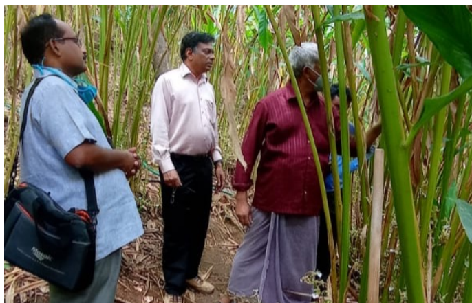
Officials of ICRI, Myladumpara at a cardamom field.